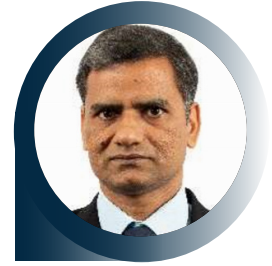
Nasimuddin Institute for Infocomm Research, Singapore